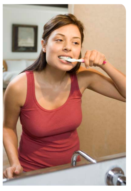
Practicing good oral hygiene can help reduce the risk of developing IE.